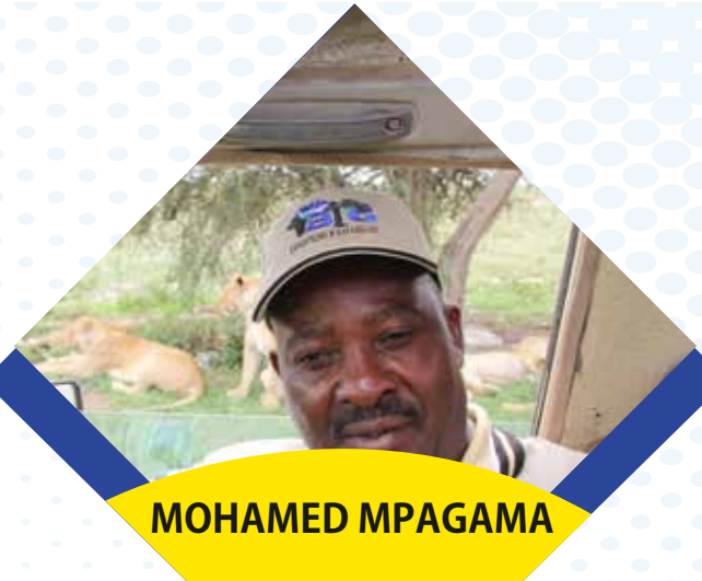
Head Driver Guide